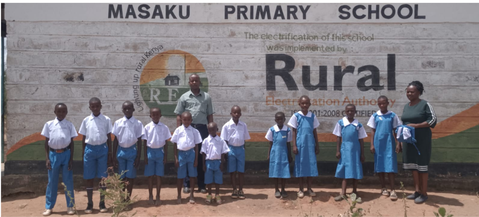
School uniforms for the most needy in Masaku Primary