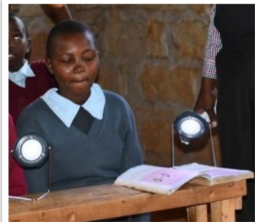
Power in your hands